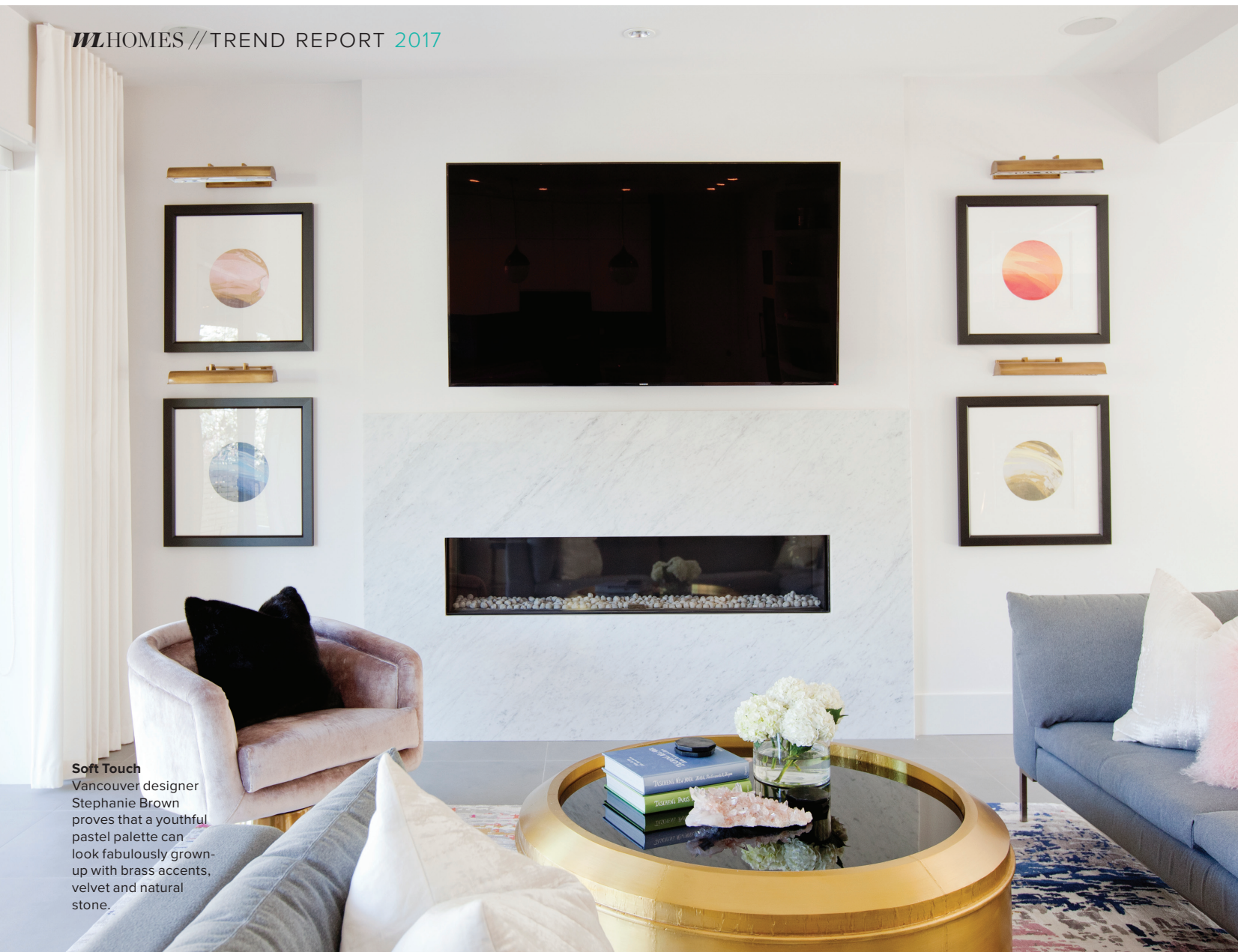
Soft Touch Vancouver designer Stephanie Brown proves that a youthful pastel palette can look fabulously grown-up with brass accents, velvet and natural stone.