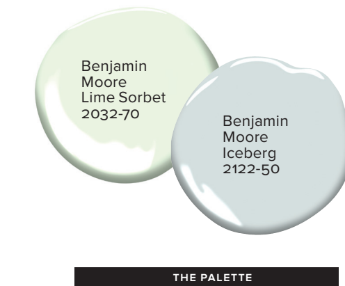
Above: Janis Nicolay

"The '80s are influencing accent colours, with pale pinks and pastel green appearing in furniture and accessories."