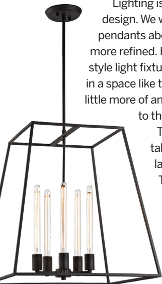
Pendant, Robinson (Matteo), $398

Task lighting like a table or floor lamp is great for layering lighting in a space. Think about going with simplicity when it comes to a table lamp and bring in brass elements. An arch floor lamp would also do the trick. The simple form of this floor lamp adds a modern touch.