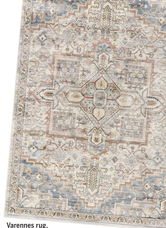
Varennes rug, Urban Barn, $399