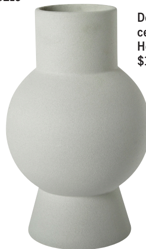
Decorative ceramic vase, HomeSense, $16.99