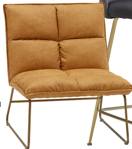
Maxwell tufted accent chair, Structure, $189

Accent chairs are the unsung heroes of the design world. They add so much to a space, and these leather tufted style chairs add a casual feeling to the space. These would also be perfect in a small space as they are armless and don't take up much visual space. The brass metal base adds a little hint of the refined.