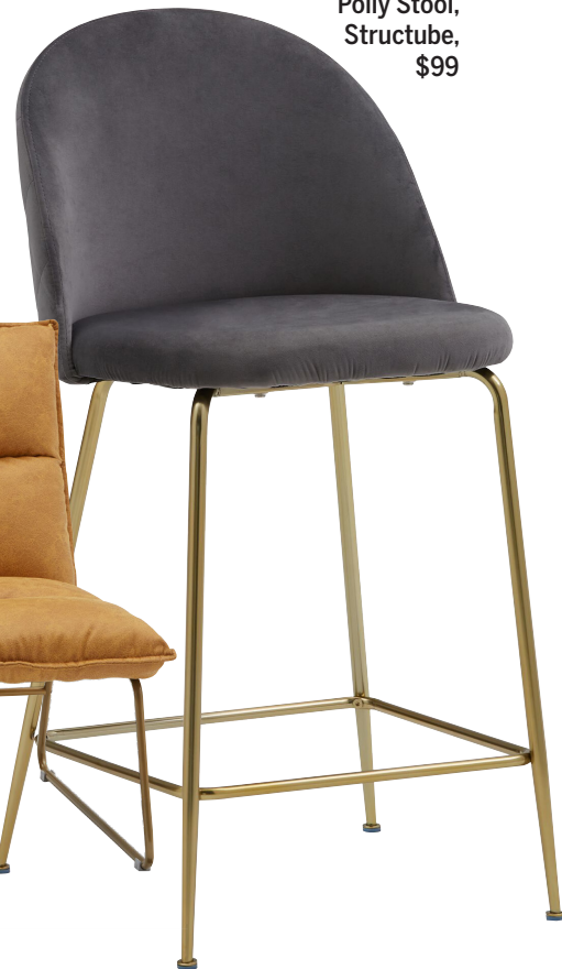
Polly Stool, Structure, $99

Mixing styles is something I do in every design. I like how it makes a space feel more curated. Rugs can sometimes get pricey, especially when you get into the handknotted and wools, however, this one is at a great price point and looks fabulous. The gorgeous tones in blues and terracotta are perfect for this look.