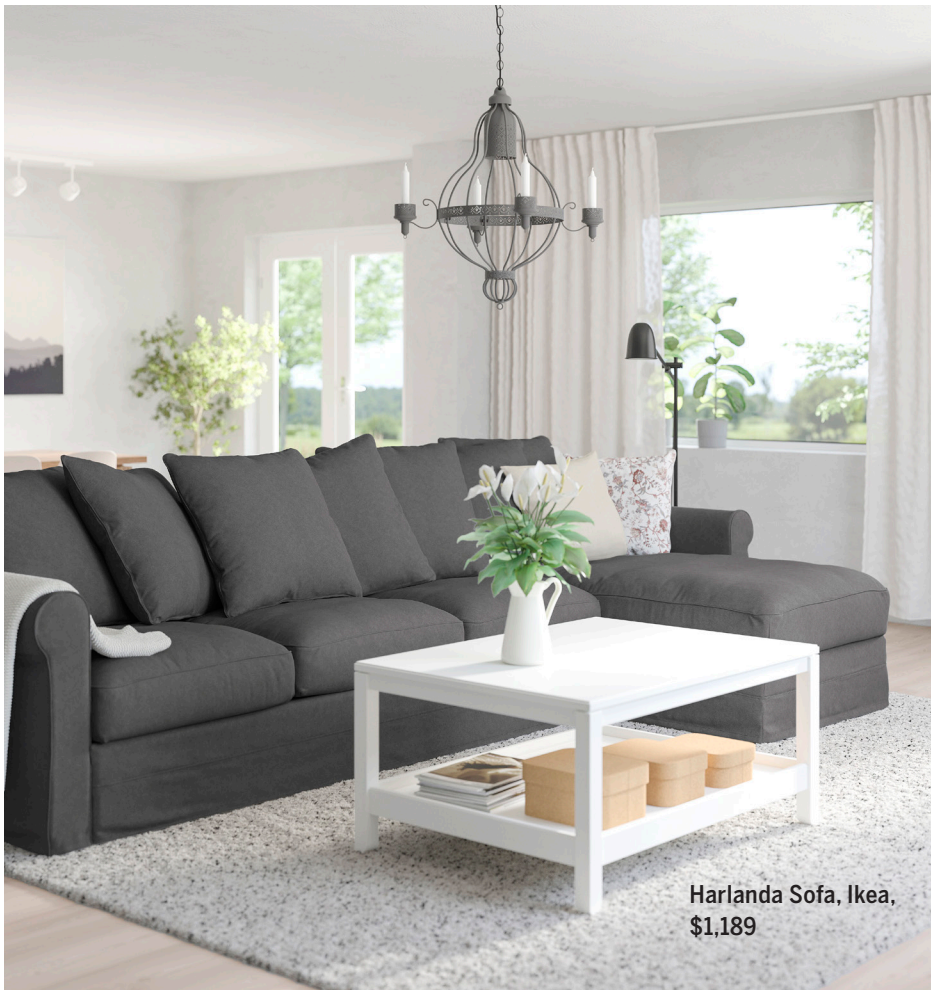
Harlanda Sofa, Ikea, $1,189

refined light fixtures and accents all work together to create a space that is warm and inviting.