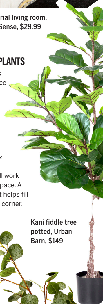
Kani fiddle tree potted, Urban Barn, $149

Greenery always helps to pull a space together. I try to have fresh greens or plants in every space to give the feeling of more life. Whether you go with real or faux, the trick is to have something that will work scale-wise in the space. A large tropical plant helps fill space in an empty corner.