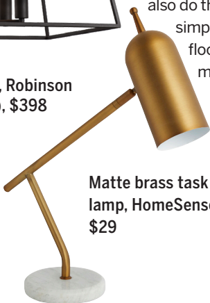
Matte brass task lamp, HomeSense $29