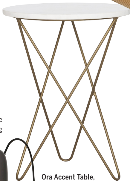
Ora Accent Table, Urban Barn, $219

In our space, we chose marble-topped tables for the side tables, which can get up there in cost. Round side tables are great because they help to break up all the squareness of the room and help to add softness to the space. I also find that they are more versatile and can be moved around easily to accommodate larger parties.