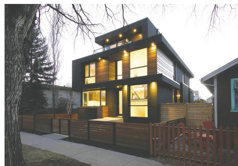
The front of the Treetops home includes a floor to ceiling window in the kitchen that allows for street-level interaction. ALLOY HOMES