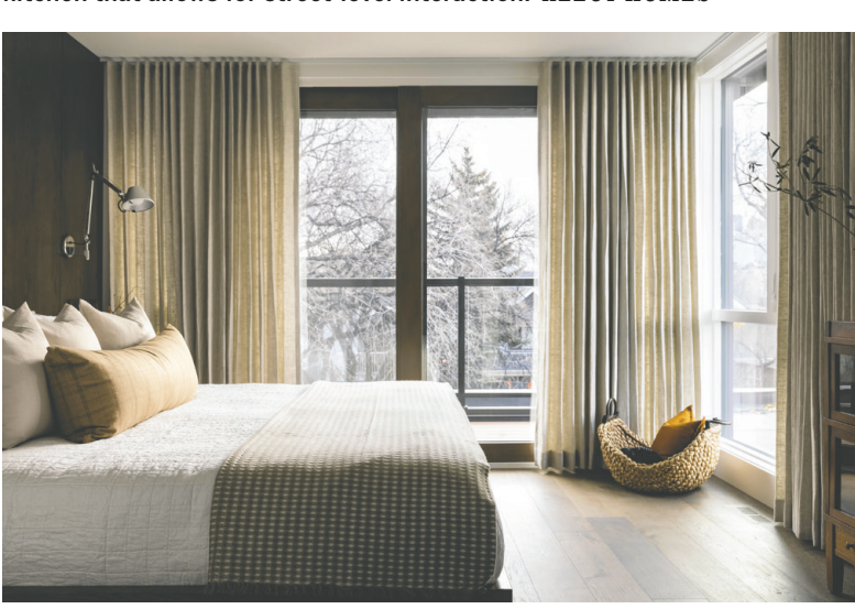
The treetop-level master bedroom is on the third floor and features floor-to-ceiling windows and a private rooftop deck. JOEL KLASSEN