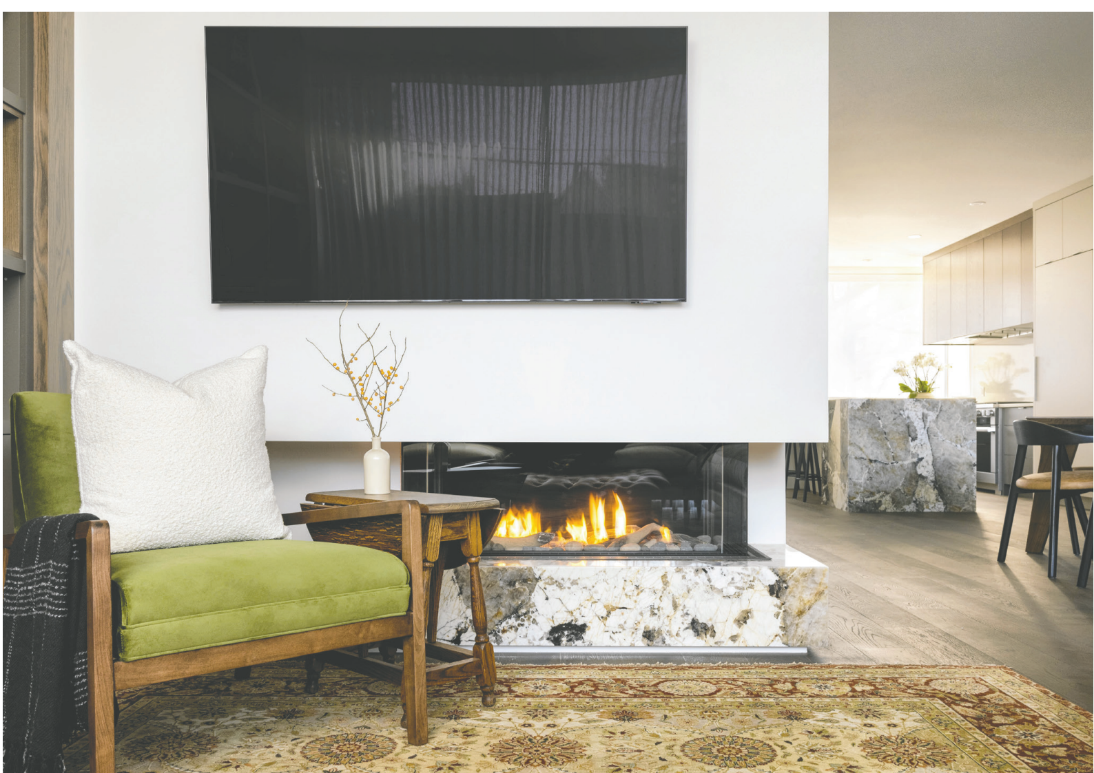
The great room in the Treetops house by Alloy Homes is part of a continuous space that runs the length of the house, and includes the kitchen and dining area. _{JOEL\ KLASSEN}

Custom-built contemporary Kensington home cocoons in a lush canopy