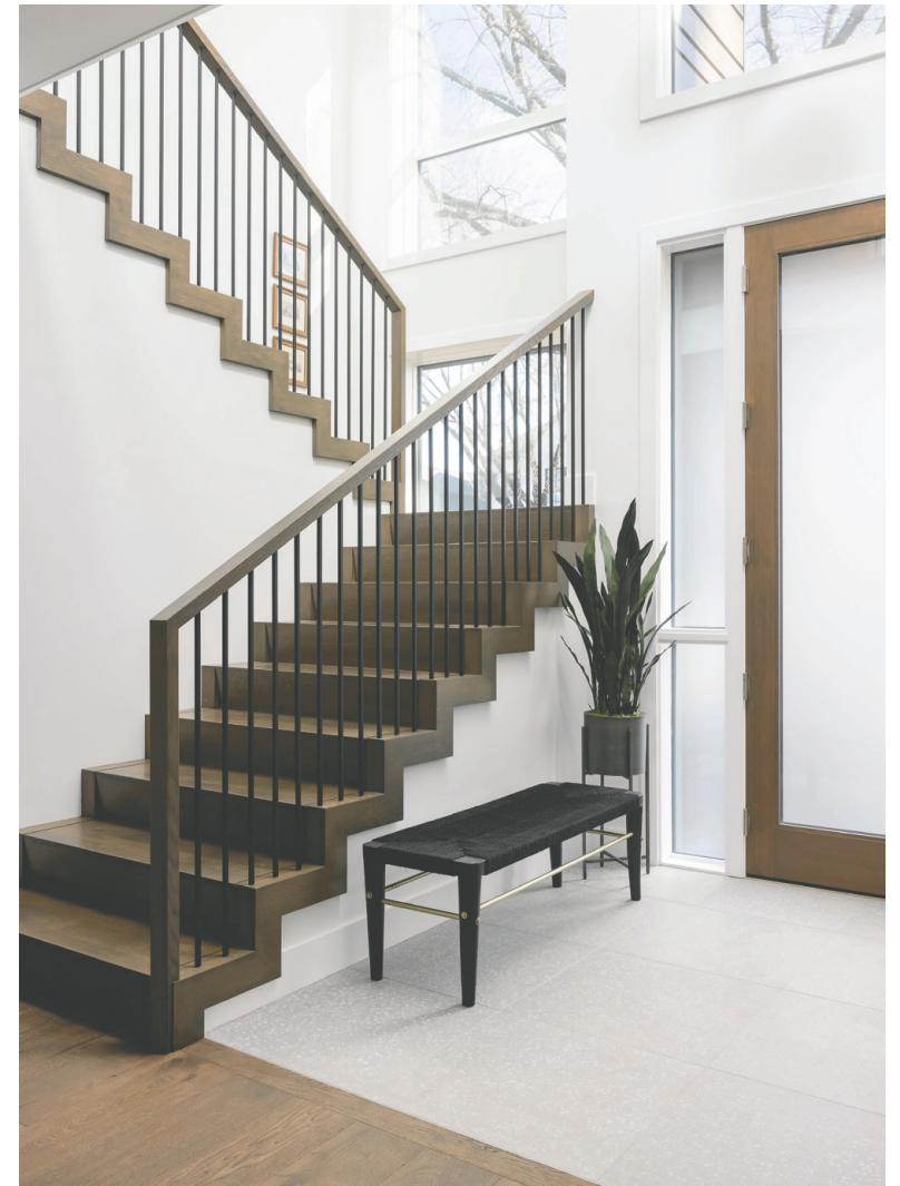
The 17-foot tall front foyer and wood-carved staircase provide a clean look, but with lots of warmth and texture. {\it JOEL~KLASSEN}