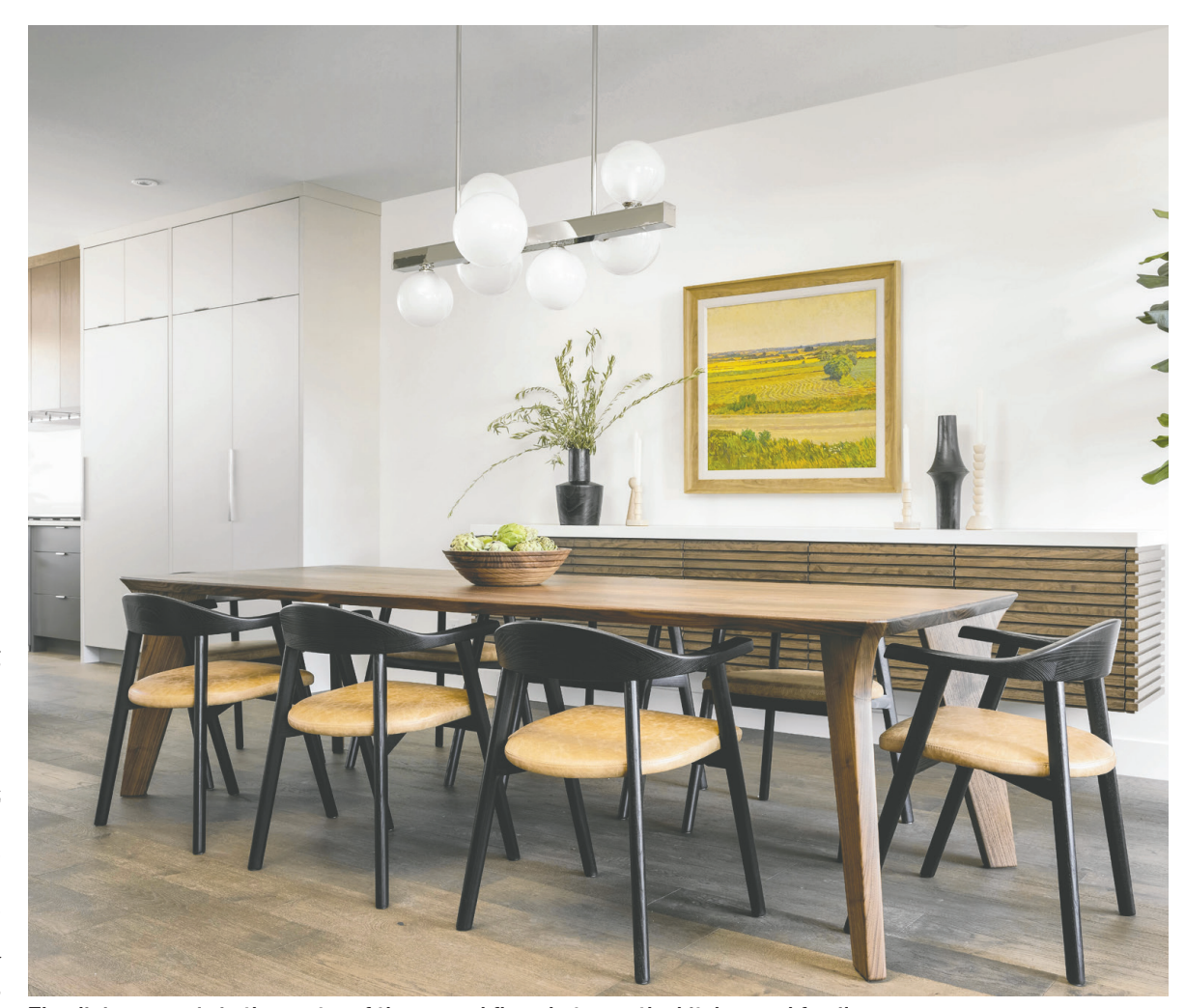
The dining room is in the centre of the ground floor, between the kitchen and family room. JOEL KLASSEN

The entire third floor loft, accessed via a separate staircase, is devoted to a private owners' retreat, with floor-to-ceiling windows and a sliding-glass door that extends to a private rooftop deck in the canopy of the 100-plus yearold trees.